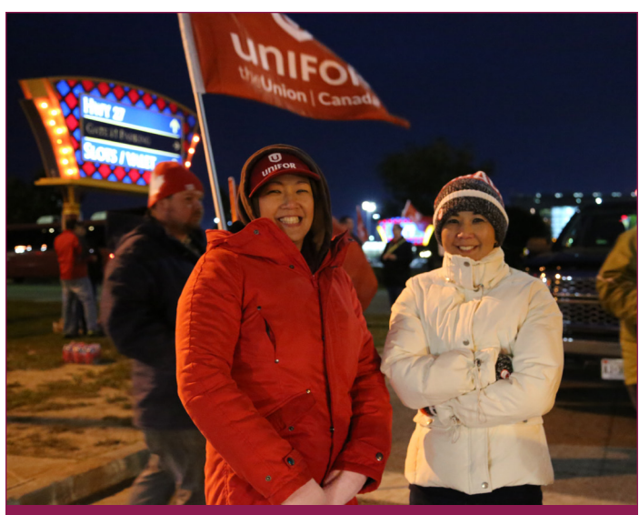
Ontario Lottery and Gaming workers at three casinos have been locked out since September 19 in a dispute over pensions.

"Wynne claims to be a champion of retirement security, yet she and her government are turning a blind eye as their privatization scheme puts that very security at risk for OLG workers," said Orr.