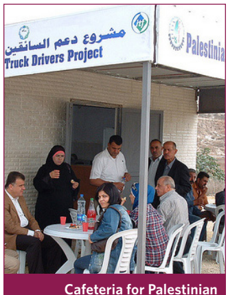
eteria for Palestinian truckers.

As well, Unifor and the ITF will work with local unions to increase the amount of cargo