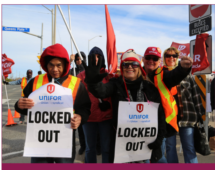
Rallies by locked out Unifor members at OLG helped turn the tide and ensure workers cna negotiate a new pension.

"Our members rallied day in and day out to send a clear message to the OLG – that we are willing to stand up for the right to negotiate the terms of our pension plan," said Dave