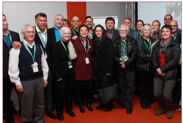
Unifor leaders and activists were among the CLC delegation to the Paris climate change talks..

"Just Transition"—the process of funding and retraining workers affected by changes in carbon intensive industries—was the top priority for the labour delegation. Unifor representatives met with Canadian negotiators and policy-makers several times during the talks.