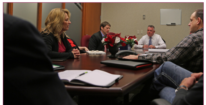
Ontario Labour Minister Kevin Flynn met with a delegation of Unifor members.

Workers from such workplaces as grocery, retail, manufacturing, social services, school busing, media, aerospace, healthcare,