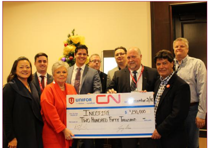
Unifor and CN Rail partner to create scholarships for Indigenous youth.

IN THIS ISSUE: Regional Council elections. Ontario Regional Council calls for social justice and political action. Unifor takes up the fight against new threat to pension security. Sponsored Syrian families begin lives in Canada. The push to change electoral politics and more!