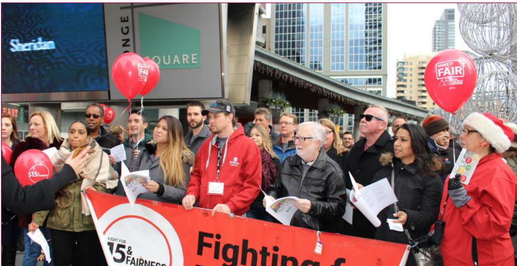
Ontario Regional Council delegates join Decent Work Sing-along at Toronto's Dundas Square to draw awareness to the Fight for $15 and Fairness Campaign.